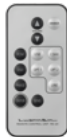
Remote Controller (RD-24)

The power environment of high inertia from a large power transformer to large capacity block capacitors and each circuit' s independent regulator is designed to provide a great drive impetus to the signal output, delivers large dynamic swings and maintains image specificity across the soundstage regardless of the listening level.