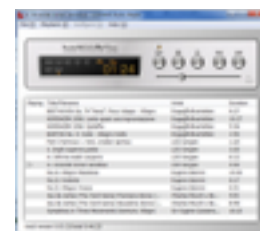
Luxman Media Player