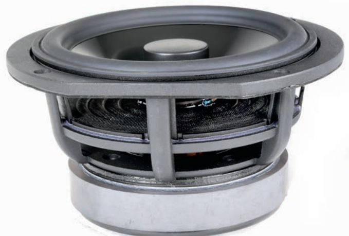
The midrange has a sturdy outer skeleton made from aluminum and an inner basket made from vibration damping plastic.