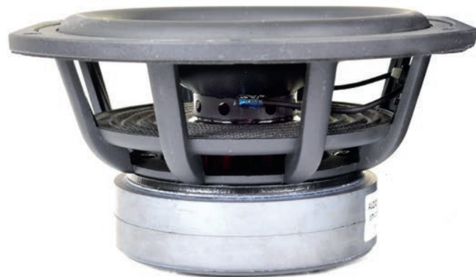
The woofer is dedicated to performance. The generous surround allows high excursions, the magnet ensures a powerful drive. The ventilation holes in the voice coil carrier serve for better heat dissipation.

Fibreboard) otherwise used in cabinet construction. The partially open honeycomb structure also increases the acoustically effective volume of the enclosure, so that the speaker offers both a lower weight and a larger internal volume while with given external dimensions.